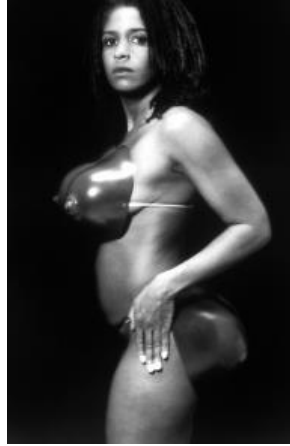
Renée Cox. Hot en Tot , 1994. Photograph.

The image is a reminder of the body and life of Saartjie Baartman, who is popularly known as the “Hottentot Venus.” Hottentot is a derogatory term for the Khoi people of South Africa, while Venus is the goddess of love in Roman mythology. Fully grasping the visual politics of Hot en Tot requires a knowledge of Baartman’s story. Saartjie Baartman, born in 1789, was from the region that is now known as the Eastern Cape in Africa. Saartjie was a mother of a child whom she outlived, the wife of a Khoikhoi man, and a servant on a colonial farm. At sixteen, her romantic partner was killed by Dutch colonizers. Soon after, she was sold into slavery, then held in captivity by an English man who required that she perform domestic labor and be put on exhibition for entertainment. Within the historical moment of the rise of scientific racism, Europeans were fascinated by her fleshy buttocks and vulva. Saartjie’s naked Black flesh was put on display for white crowds to marvel at the supposed visual representation of African biological inferiority.