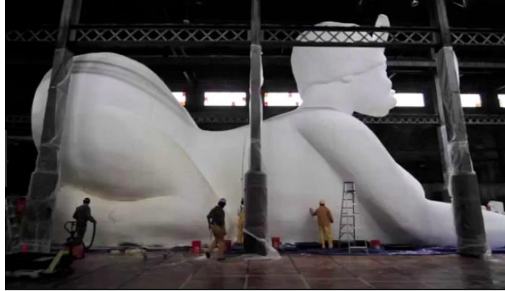
Kara Walker. A Subtlety or the Marvelous Sugar Baby an Homage to the unpaid and overworked Artisans who have refined our Sweet tastes from the cane fields to the Kitchens of the New World on the Occasion of the demolition of the Domino Sugar Refining Plant , 2014. Sculpture.

The mammy and the fleshy bottom that alludes to Saartjie Baartman are fused together in the neatly synthesizing form of the sphinx to create this sculpture. To understand this creation requires a grasp of the thematic fullness of the artwork. The complete title is A Subtlety: The Marvelous Sugar Baby, an Homage to the unpaid and overworked Artisans who have refined our Sweet tastes from the cane fields to the Kitchens of the New World . The sculpture is gigantic, measured at 75 feet long and 35 feet tall. Through its vast form, shape, and technical composition, A Subtlety raises questions about labor, sexuality, race, gender, and the female figure in similar and different ways to the approaches of Weems, Cox, Faustine, and Mutu.