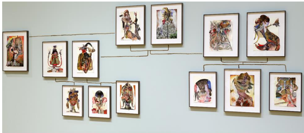
Wangechi Mutu. Family Tree , 2012. Mixed-media collages on paper.

survive colonialism, displacement, hunger, and consumption. Mutu's treatment of the museum in exhibiting A Fantastic Journey reveals her engagement with the gallery space as a fantastical world of its own. The physical domain that Mutu creates, even bound by gallery walls, transcends conventional notions of the exhibition space. The Fantastic Journey is not merely an experience allowing for passively viewing and examining Mutu's work, but is also distinguished by an immersive sensation of being enveloped in the aesthetic and creative landscape of the works on display, through which the material presence of her work builds an atmosphere that transports gallery patrons from the world they are accustomed to into a realm designed by Mutu herself. This emphasizes a mapping of the artworks in the exhibition, and allows the physical movement of viewers through the space to feel like an exploratory process. Mutu's work not only transforms space and time, but causes a metamorphosis of culture and origin stories as well.