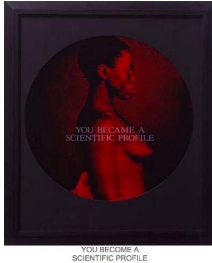
Carrie Mae Weems. You Become A Scientific Profile, From Here I Saw What Happened and I Cried , 1995-1996. Photograph.

Thus, Weems' photograph of the African woman places biopolitical discourse in conversation with photography. The biopolitical nature of the photograph has a historical background of enslaved women being experimented on, exhibited, and abused for the foundations of modern fields such as comparative anatomy and gynecology. The camera, which is able to capture the visual representation of a Black body, is an uncomfortable technology in white hands when we consider the violent histories I have noted. Visual media are a site at which Black bodies are vulnerable, such as on the auction block or on display for white scientists. In contrast, Weems is attempting anti-racist work with the camera. She uses photography to expose the ways in which photography has worked for and with projects of racialization.