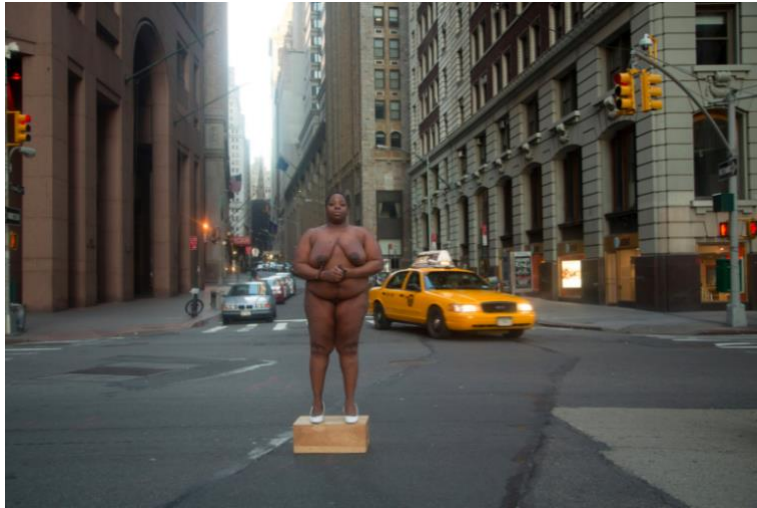
Nona Faustine From Her Body Sprang Their Greatest Wealth , 2013. Photograph.

those who were enslaved, and to embody the history of slavery through a performance and intervention. The ways in which Faustine incorporates herself into a landscape reminiscent of slavery and its afterlife makes her work deeply tied to Spillers' conceptualization of the flesh, because it embodies a specific vulnerability that is unique to Black female subjects.