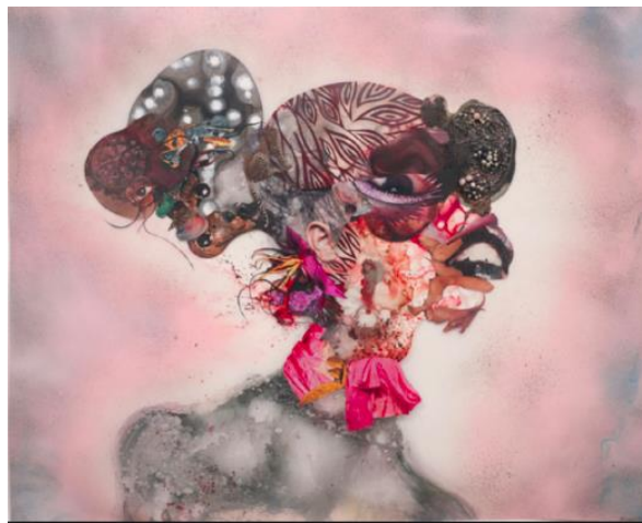
Wangechi Mutu. Pretty Double Headed , 2010. Mixed-media collage on paper.

two white legs. The entire collage seems to form one figure that is sitting down with crossed legs. We see Black flesh, animals, a weapon, and a white man thinking. Second Snake Spawn represents the body, sex, and violence as entangled with Western thought, ethnography, and violence. The surrealist and nightmarish qualities of the work parallel the chaos of these objects and what they represent. Second Snake Spawn uses abstraction and surrealism to represent the interconnectedness of violence, Western thought, mortality, ethnography, and the pornography through the symbolism of the gun, the man deep in thought, the skull, the ethnographic photograph, and the phallic limb.