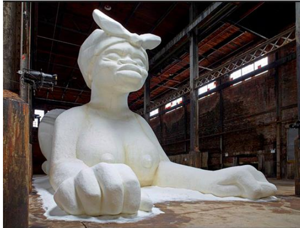
Kara Walker. A Subtlety or the Marvelous Sugar Baby an Homage to the unpaid and overworked Artisans who have refined our Sweet tastes from the cane fields to the Kitchens of the New World on the Occasion of the demolition of the Domino Sugar Refining Plant , 2014. Sculpture.

Although it is a sculptural formation, A Subtlety or the Marvelous Sugar Baby is an abstracted figure that combines a sphinx and a Black female figure. Like Mutu's collage practice, Walker pulls from more than one visual register to render the Black female-ish figure in this sculpture.