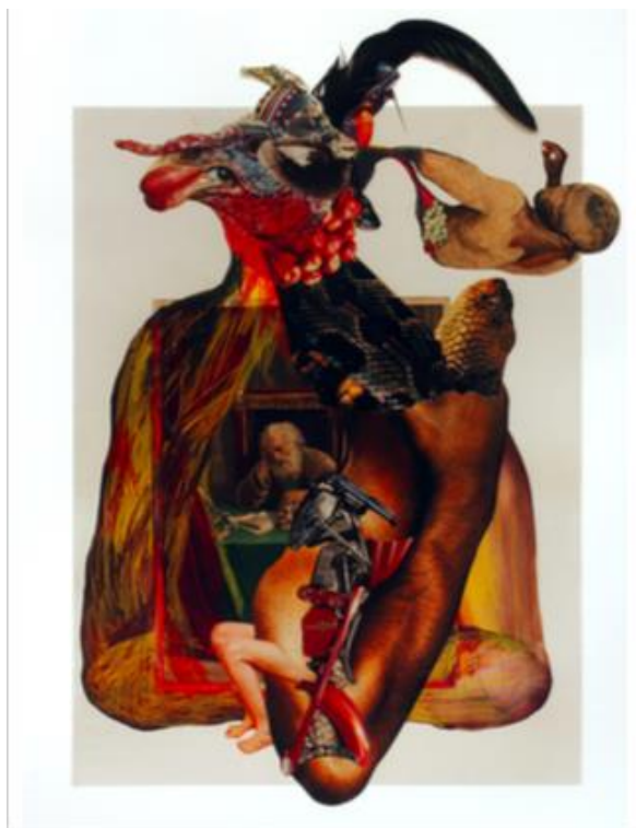
Wangechi Mutu. Second Snake Spawn, Family Tree , 2012. Mixed-media collage on paper.

One of the collages within Family Tree is Second Snake Spawn . Second Snake Spawn is an example of Mutu's work that pulls material from National Geographic, art history, and pornography. Starting from the top of the image, there is an image of a Black person's head that appears as if it could be an ethnographic photograph of an indigenous African in a National Geographic magazine. There is a snake that has a bird-like face, with a cut out of human lips in place of a beak. There is a black feather hanging off of the configuration of the bird, snake, and Black face. In a similar fashion as the composition of the feather, there is another image of a Black person's face and torso that could be an ethnographic photograph from National Geographic. At the center of the collage is a portrait of a white man, deep in thought, with a skull on his desk. The skull is a reoccurring theme in Western art which symbolizes mortality. There is a Black arm with visible muscles, which is phallic in nature; the arm has a snake where the hand would be. Next to the phallic arm is a gun. To the bottom right hand corner of the gun there are