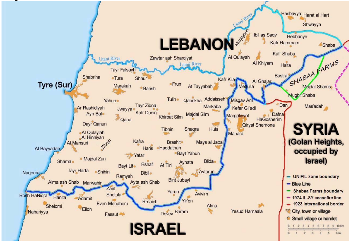
Map 2: Southern Lebanon and the Israeli-Lebanese Border